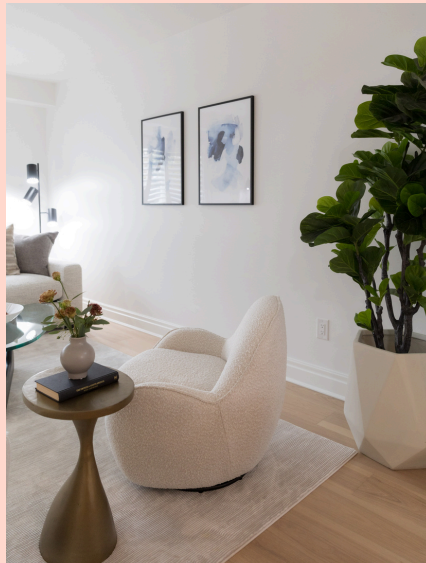
Big Coat Media