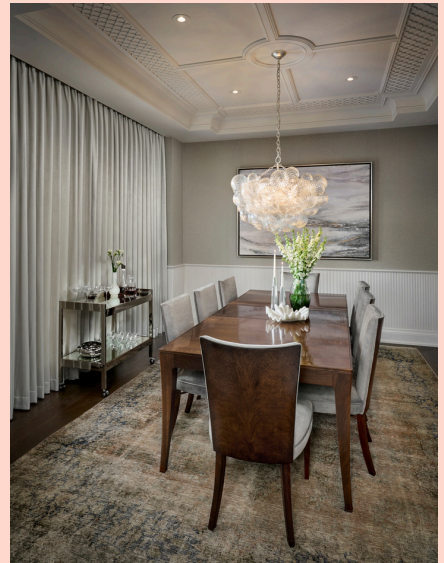
Khachi Design + Build

This month has been all about creative energy and collaboration! We've teamed up with some incredible designers and builders across the GTA to showcase the beauty of Brenlo products in real time. From behind-the-scenes installation reels to final reveal photoshoots, our social media is buzzing—and we don't want you to miss out.